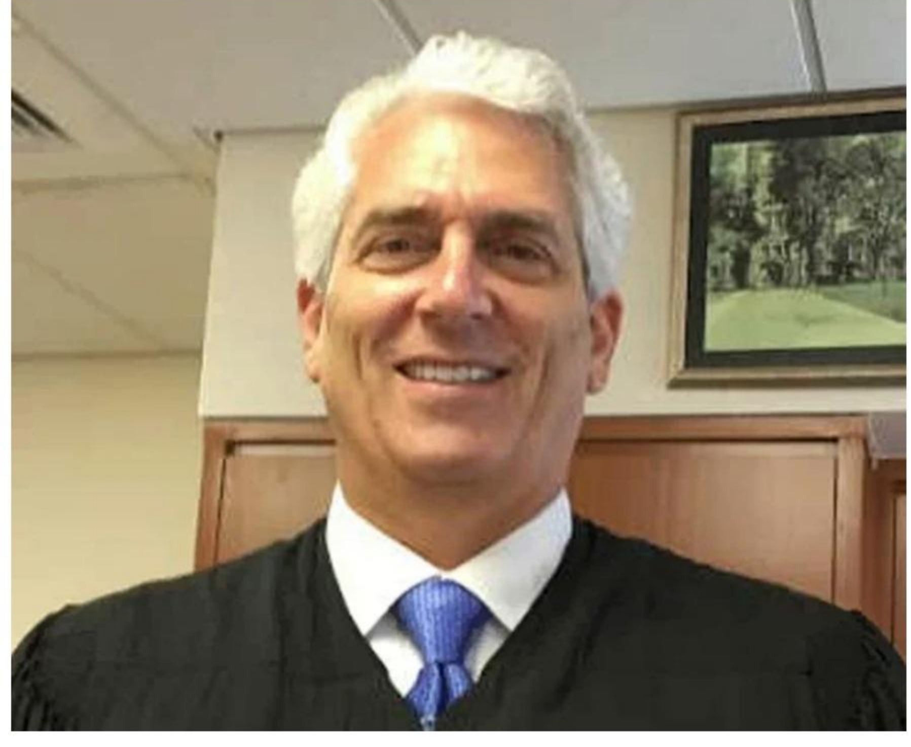
Miami-Dade Circuit Judge Alan Fine.