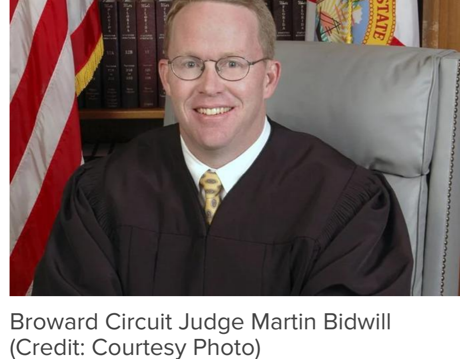
Broward Circuit Judge Martin Bidwill